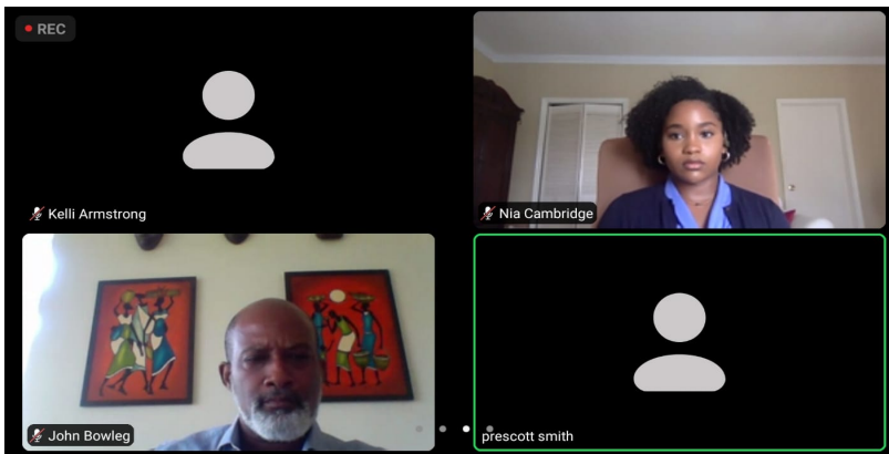
Figure 2. Question and answer session during the introductory webinar on 2 September 2020.