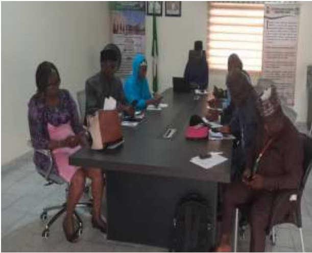
Familiarization meeting with available stakeholders