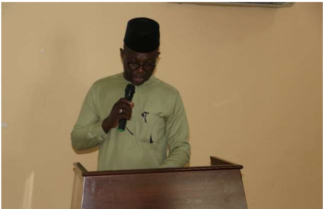
NATIONAL FOCAL POINT PRESENTING HIS WELCOME ADDRESS