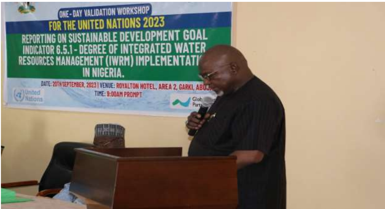
Opening Ceremony with the Executive Director, NIWRMC/Sterring Committee Chairman giving his keynote Address.