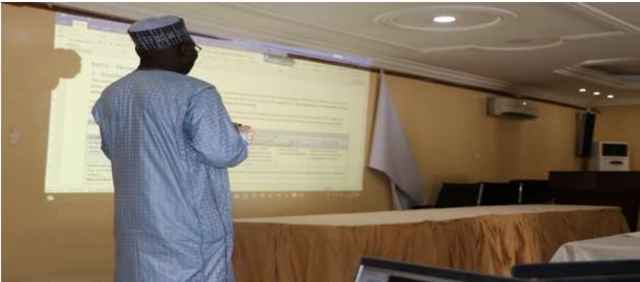
Review and Validation of Questionnaire anchored by the National Facilitator