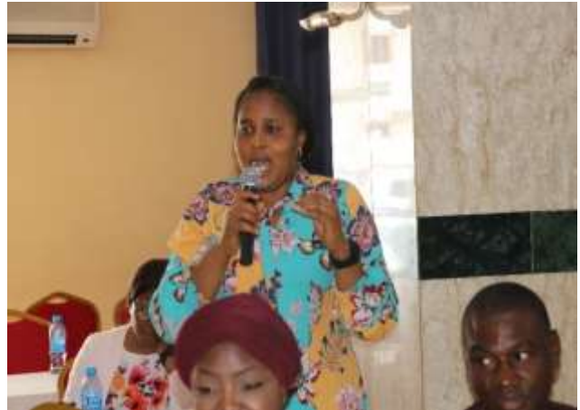
Input by participants and stakeholders