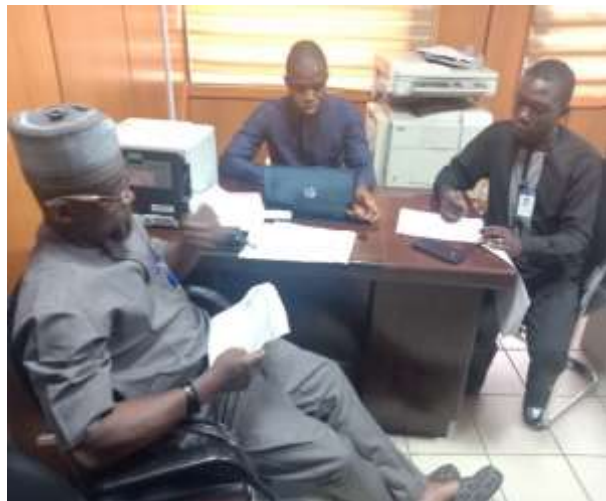
Task Team on the field with stakeholders