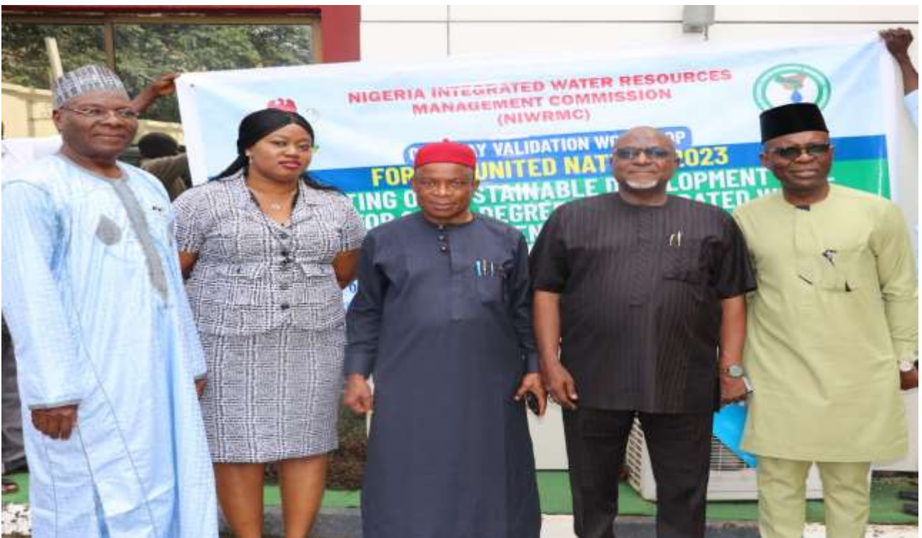
Group Photograph of the Executive Director, NIWRMC, The GWP-N Chair, The National Facilitator, National Focal Point and the GWP-Nigeria Executive Secretary.