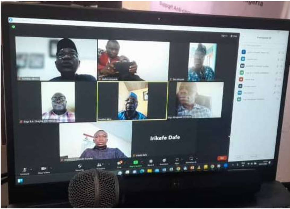
Some online participants