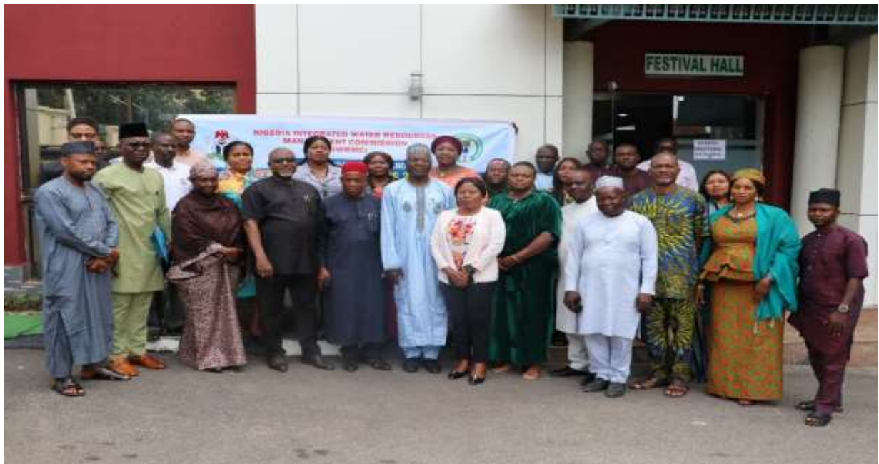
Group Photograph of participants