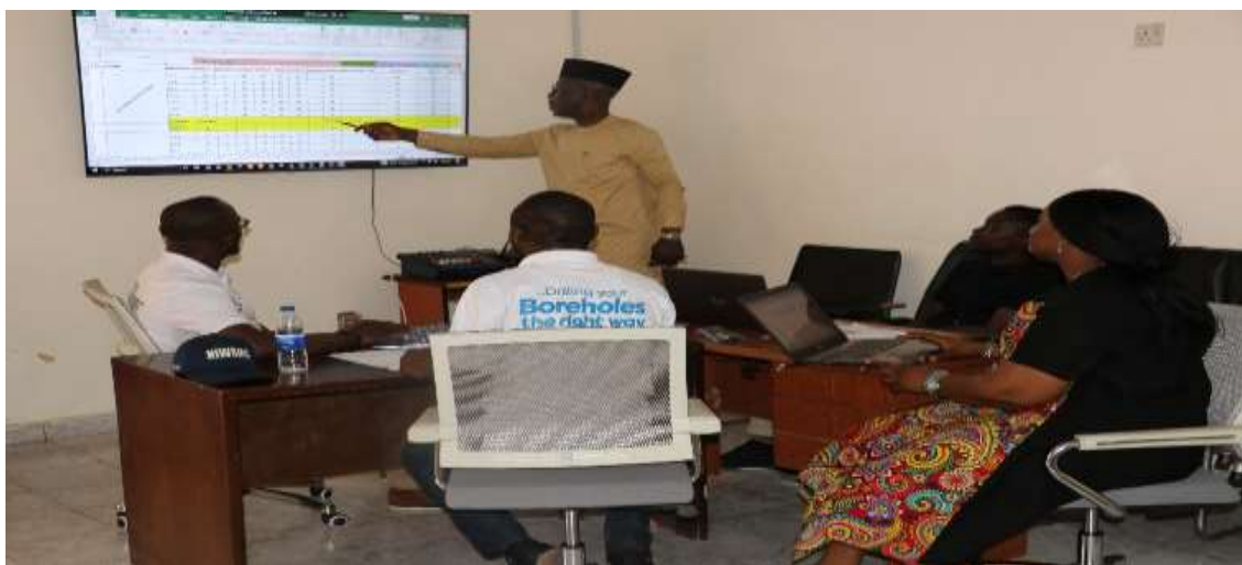
National Focal Point and Task Team at work